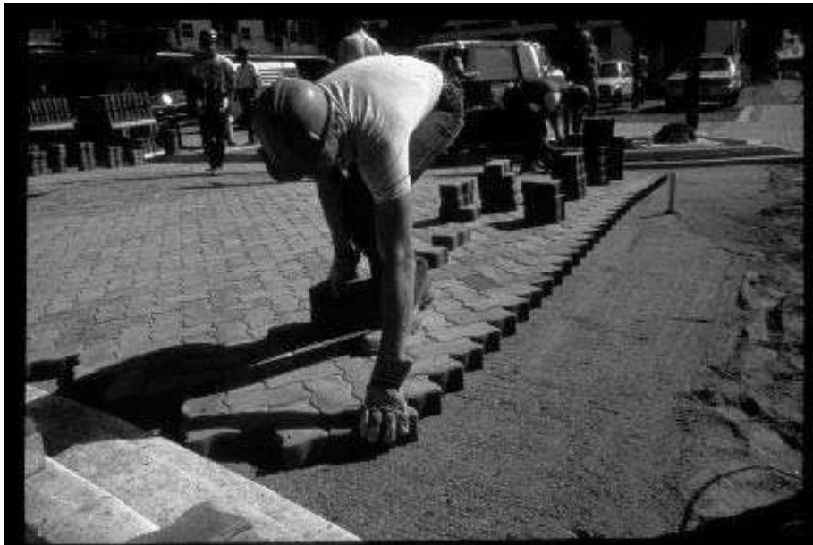
Figure V: Installation of the pavers on Main Street, North Bay – Note the 45-degree herringbone pattern utilizing Type 1 – wavy edged, 80 mm thick concrete pavers.