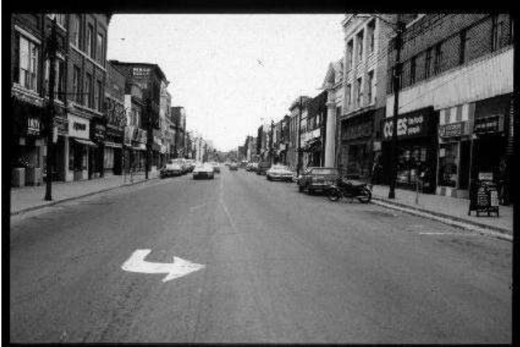
Figure II: Main Street North Bay before 1983 re-construction