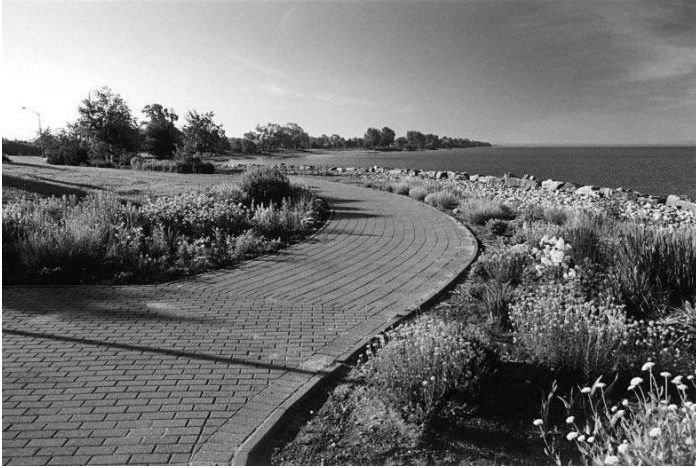
Figure X: The award winning North Bay Waterfront Park has utilized interlocking concrete pavers extensively