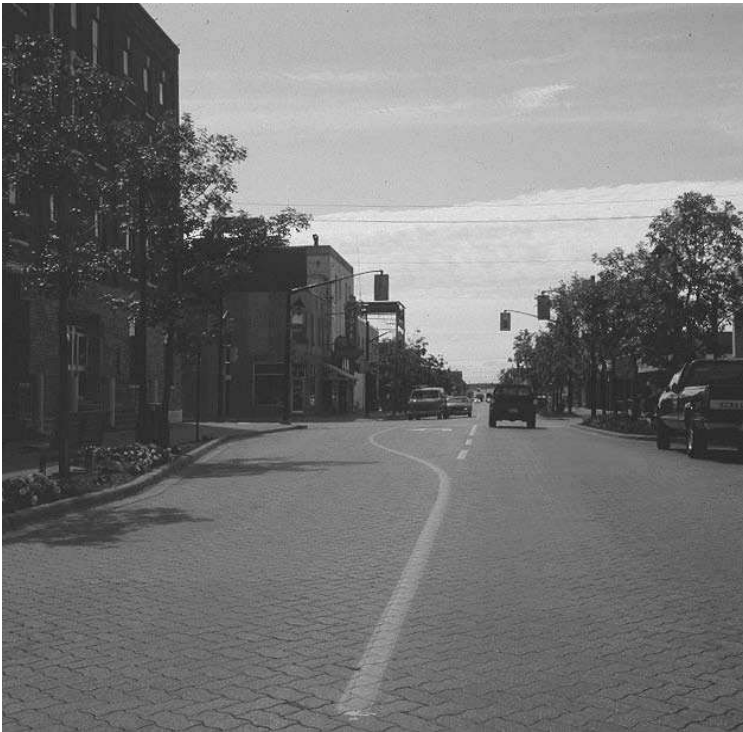
Figure III: Main Street North Bay immediately after re-construction – 1983 Overhead wiring was removed in 1984