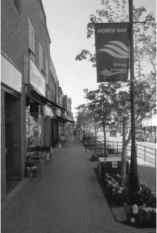
Figure IX: The back of sidewalk cast-in-place edge restraint at the building interface was beneficial both from a uniform visual appearance and with offering an easy way to set grades for the back of sidewalk