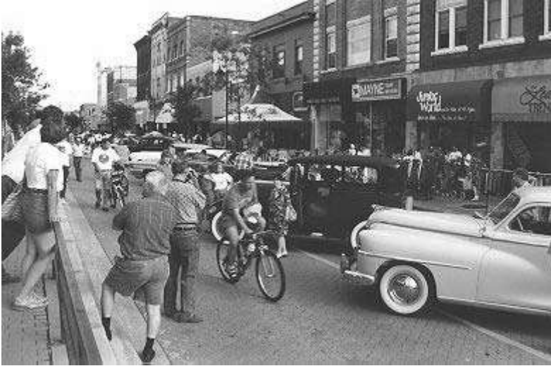
Figure VIII: The choice of Interlocking Concrete Pavements for Main Street North Bay has proven to meet the original intent of the project’s landscape architect – transformation of the City’s dated Downtown appearance into a “people friendly” place.