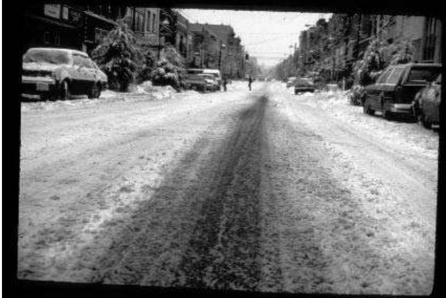
Figure IV: Typical winter conditions in North Bay