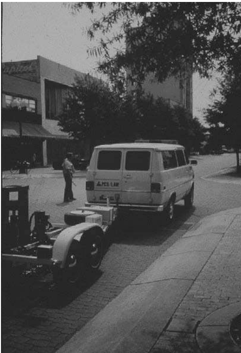
Figure VII: FWD testing utilized a Dynatest Model 8002 similar to the one pictured above