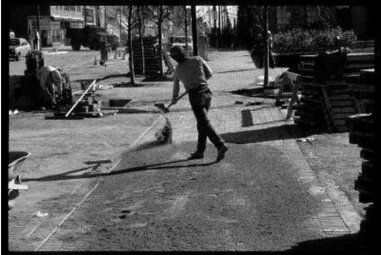
Figure VI: Joint Sand is spread on the pavement. Also of note is the soldier course used on pedestrian areas adjacent to the cast-in-place concrete edge restraint.